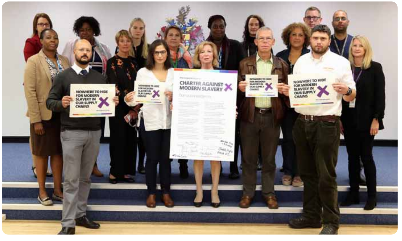
Enfield Against Modern Slavery Charter

The following priorities will reinforce and continue to deliver our commitments in protecting our residents from the harms of modern slavery, engaging at various levels of service delivery.